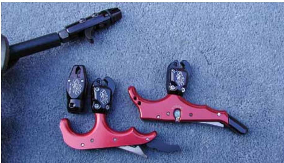
Different release aids and different length release heads must be figured into matching bows to shooters of differing heights. Switching to the longer release head will dictate shortening the d-loop or the bow's draw length in order for the system to remain the same length. Adjusting the d-loop length is an easy and cheap way to change draw length.

BOW GRIP SHAPE AND STYLE: Lots of bows have removable grips and, of course, archers remove them. When you see your customer has done this please remind them that they have effectively increased their bow's draw length. The amount of change is equal to the thickness of the removable grip at the bow-hand pressure point; this is usually about 1/4 to 1/2 inch. If the increased draw length puts their body in correct alignment then all is well. If not then the d-loop needs to be shortened, the module needs to be changed or some